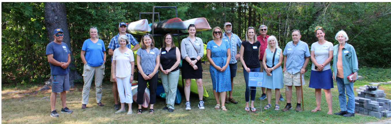
York River Stewardship Committee members and project partners stand next to kayaks purchased for upcoming programs.

The Stewardship Committee established its first grants program to award funding for local projects that help implement the York River Watershed Stewardship Plan. The Committee awarded $42,000 in grants to five groups. Their projects include land protection, public access, recreation, outreach and education activities with project goals of resource preservation, connecting people to the river, and fostering sustainable approaches.